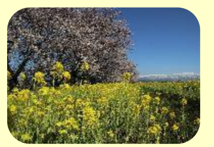
Kajikawa Chisui Memorial Park

Tourism association of Shibata city Tel: 0254-26-6789