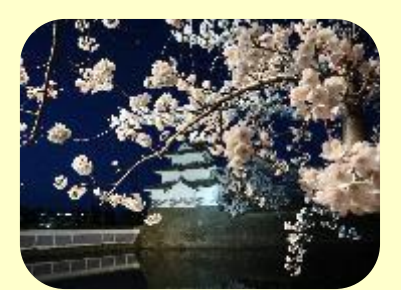
Shibata Castle Ruins Park Cherry Blossoms Festival